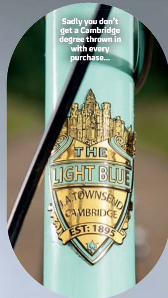
Sadly you don't get a Cambridge degree thrown in with every purchase...